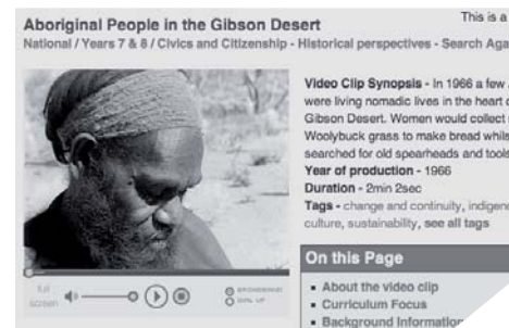
Screen shot from www.filmaust.com.au/learning .

Over 400 quality clips are now available online and are being regularly updated.