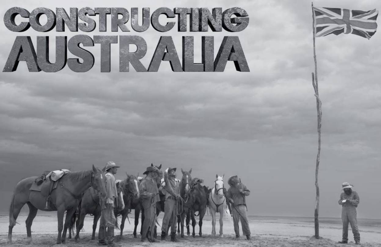
From Constructing Australia: A Wire Through the Heart.